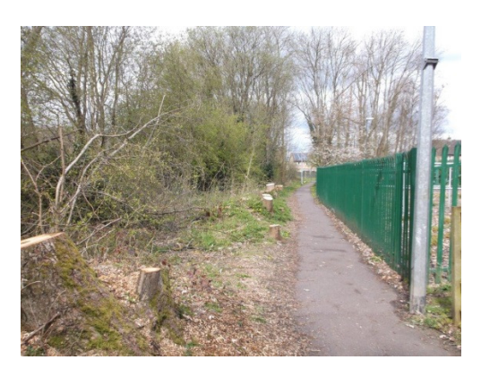
Phase 3: Church Road, Churchtown to Harrison Way, Northwood – the surfacing work is complete and the accompanying fencing work will be carried out during May and June.