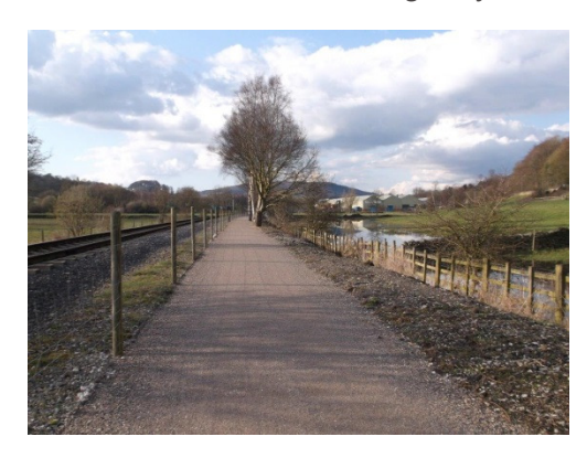
Phase 4: Harrison Way, Northwood to Old Station Close, Rowsley – some of the surfacing work has been completed and a 2.7m wide plastic boardwalk will be built over the central wetland section starting at the end of May with is estimated to be completed by July.