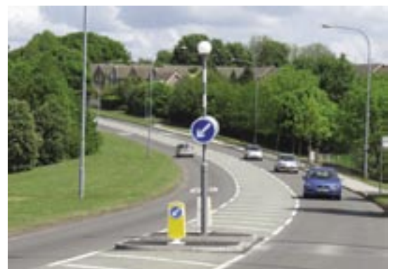
Revised speed limits and crossing point on Loundsley Green Road.

Changes to speed limits, in conjunction with appropriate enforcement, education or engineering measures, also significantly reduce collisions and casualties.