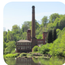
Masson Mill, Cromford, part of the World Heritage Site