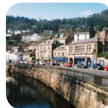
The Promenade, Matlock Bath