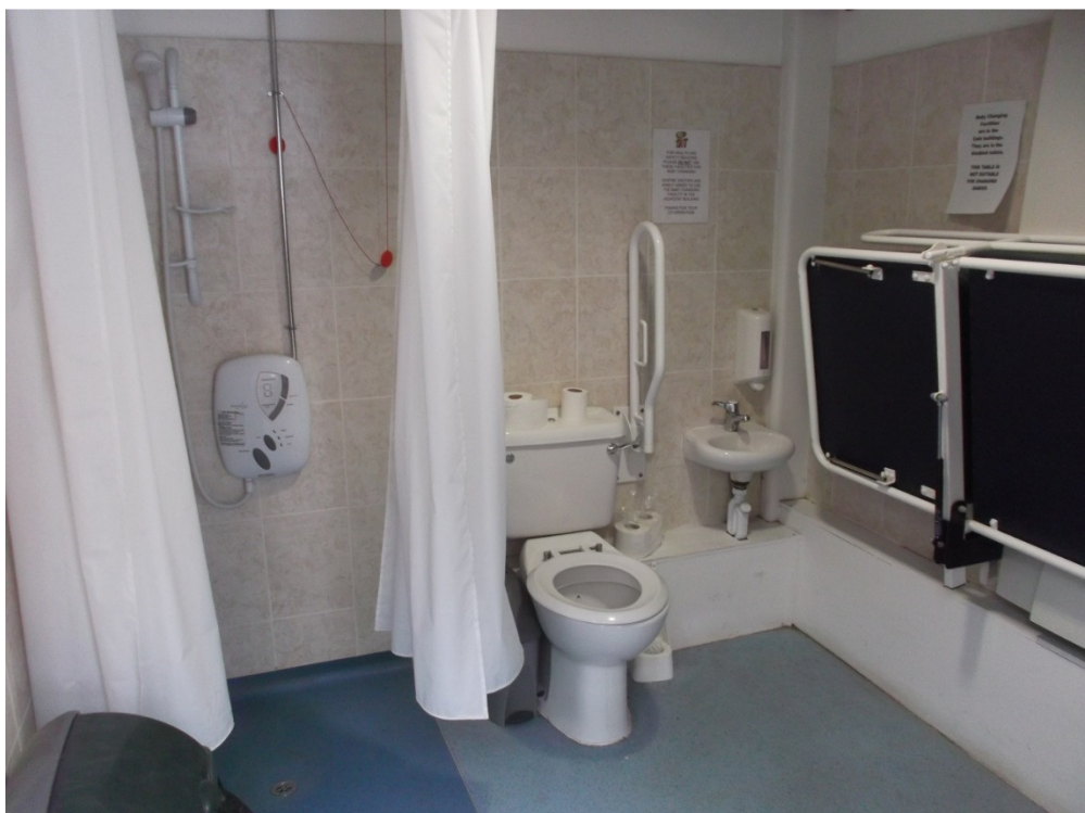
Access to the toilet with the couch folded away