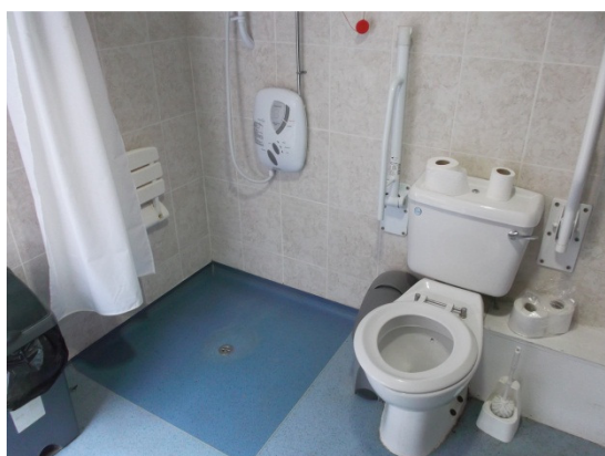
Level access shower