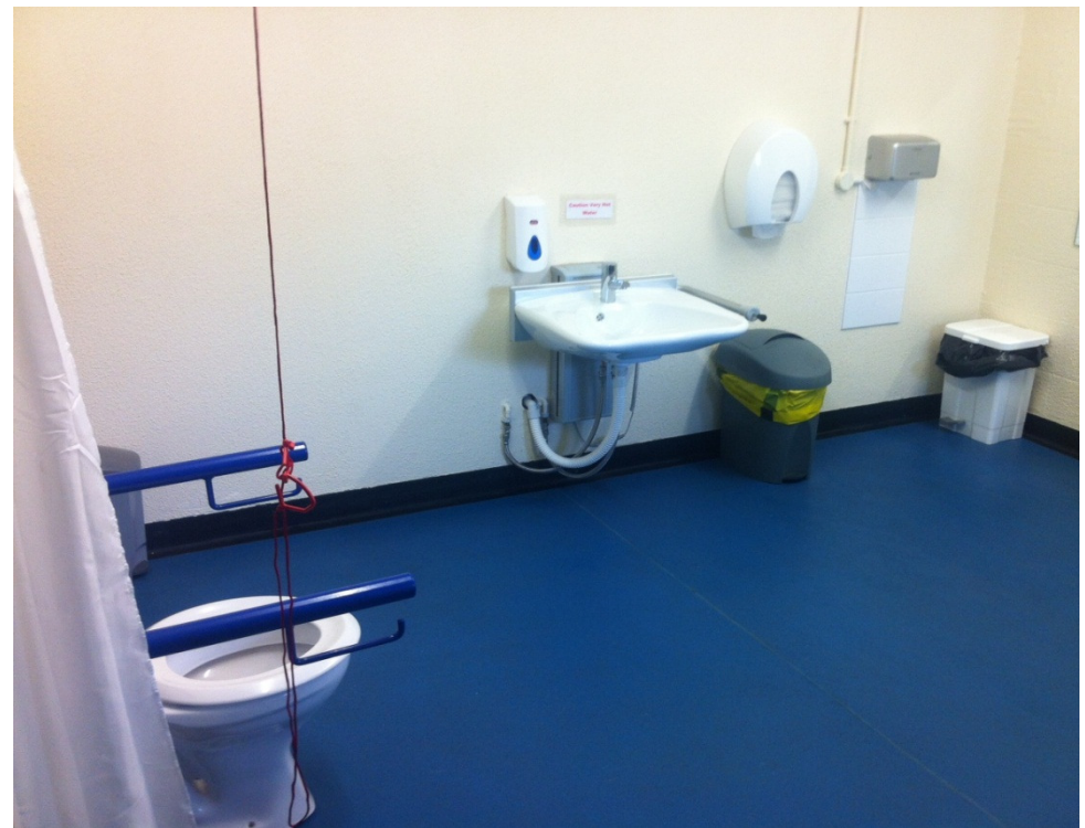
Spacious room and height adjustable wash hand basin