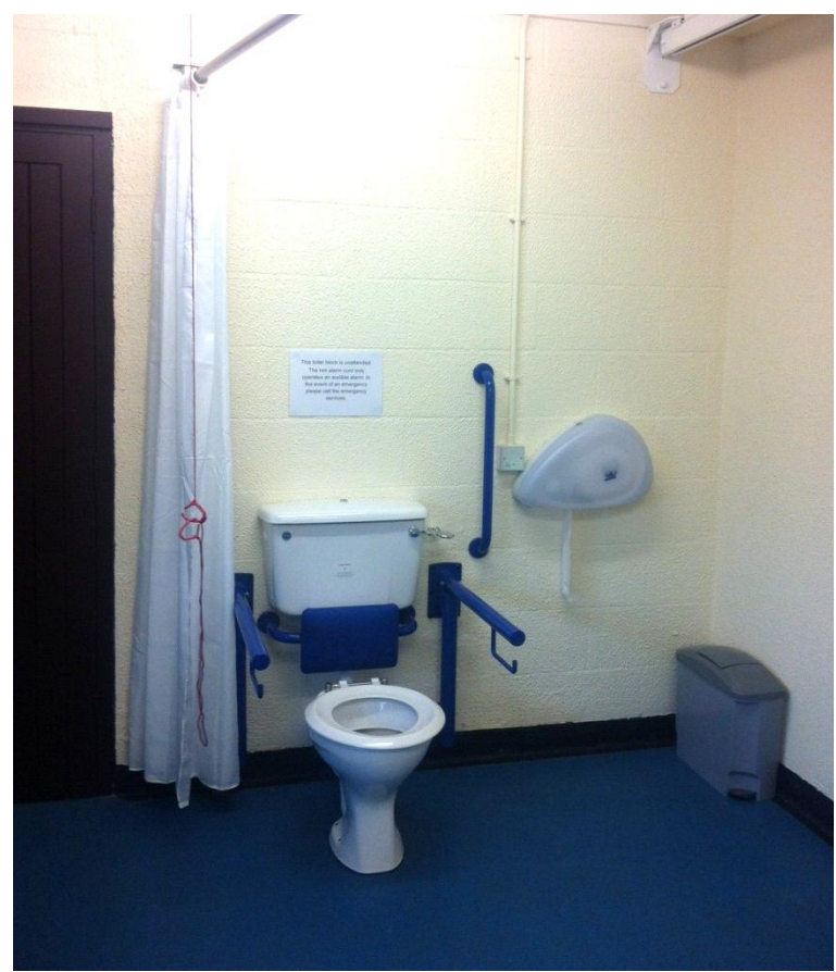
Toilet with space either side and privacy curtain