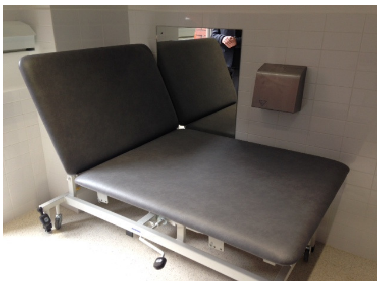
Free standing adjustable height changing couch