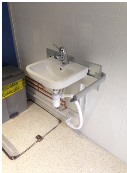
Adjustable height finger rinse basin