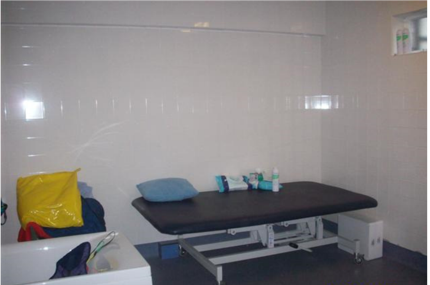
Room 1 – larger sized changing couch