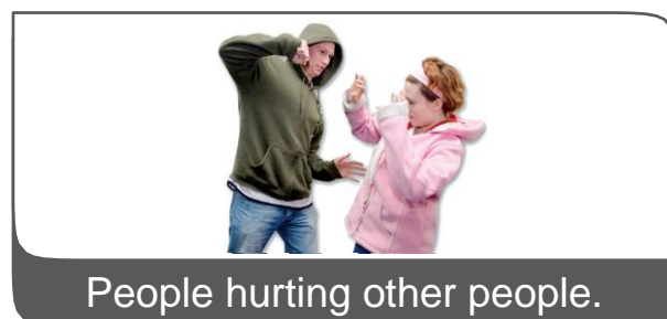
People hurting other people.