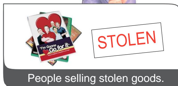
People selling stolen goods.