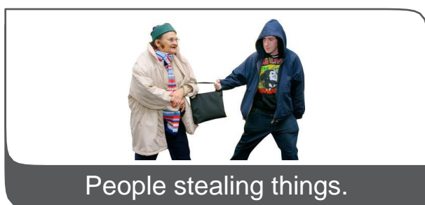
People stealing things.