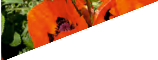
From left to right: The John Varley trip boat at Tapton Lock, artwork produced at the Tapton Festival 2013, poppies and other wildflowers grow on the canalside.