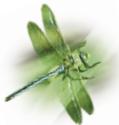
Emperor Dragonfly Anax Imperator