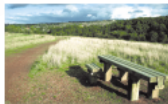
Peter Fidler Reserve Former Bolsover South Tip B

The Peter Fidler Reserve comprises new pathways, picnic areas and viewpoints overlooking Bolsover and the Doe Lea Valley. The commemorative stone cairn installed on the reserve similar to his memorial at Dauphin in Canada. Access to the Peter Fidler Reserve is available for walkers, cyclists and horse riders.