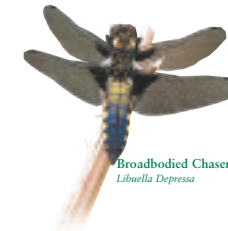
Broadbodied Chaser Libellula Depressa

These habitats attract a variety of wildlife. In spring, plovers and several species of duck come to breed. In winter, large flocks of Lapwing, Golden plover and gulls use the site. The meadow areas are also popular with butterflies and the pools attract dragonflies such as Black Tailed Skimmers and Broadbodied Chaser. Walkers access only from Stockley Trail and Peter Fidler Reserve.