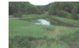
This is the new reed bed created at A

In the summer Dragonflies are on the wing in the Peter Fidler Reserve. Watch over the new pools for these fascinating insects. You will see Emperor, Brown Hawker, Common Darter