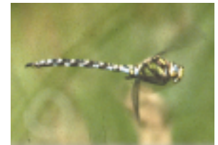
Southern Hawker Aeshna Cyanea

Located within the old colliery yard to the east of the River Doe Lea is an area of derelict land commonly known as Snipe Bog. This area contains two small ponds, reedbed and carboniferous limestone embankments colonised by rare calcareous plant species. With ecological advice from Derbyshire Wildlife Trust, Groundwork Creswell have improved access to this area whilst maintaining these diverse habitats.