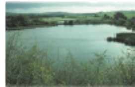
Carr Vale Flash Nature Reserve