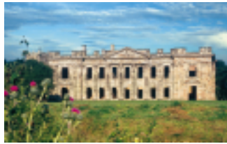
Sutton Scarsdale Hall