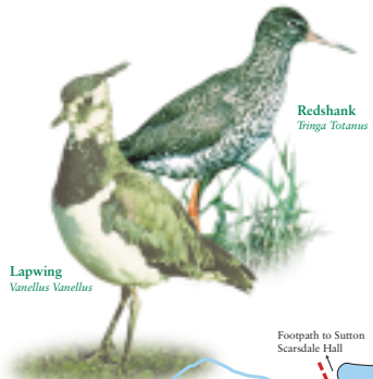
Redshank Tringa Totanus