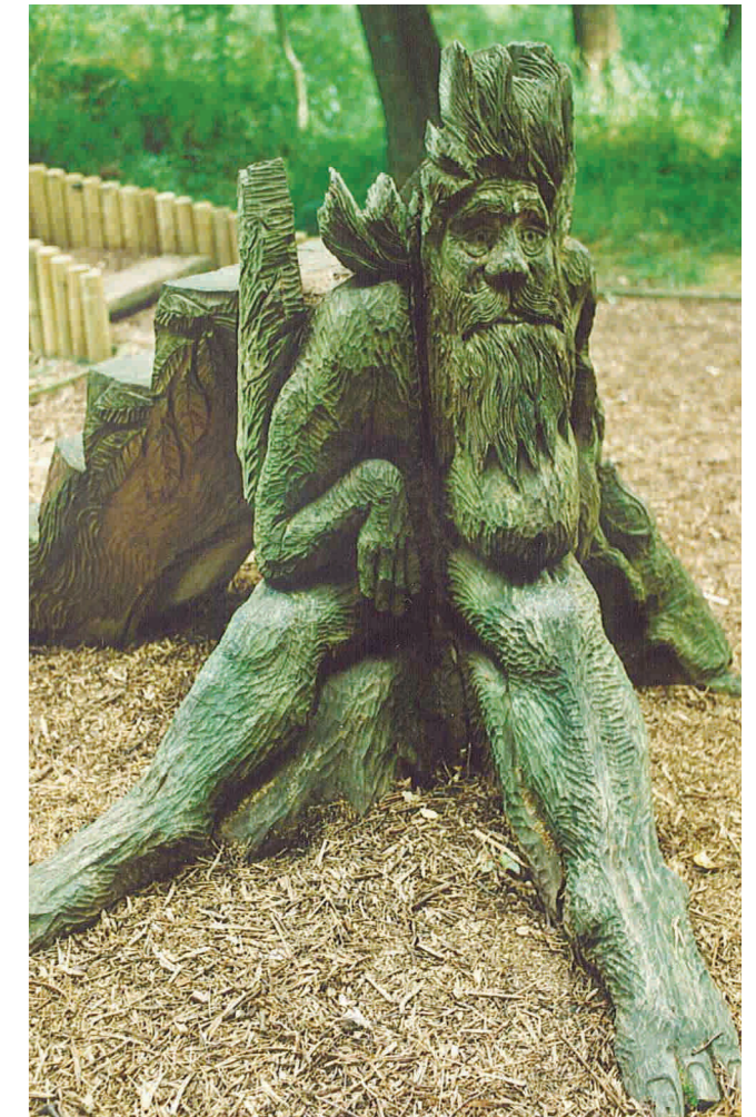
Tree sculpture at Teversal Visitor Centre

This visitor centre is run by volunteers and is usually open all year round. With lots of space for parking it is an ideal starting point to get onto the Silverhill, Pleasley and Teversal Trails and a good place for a cup of tea when you have finished!