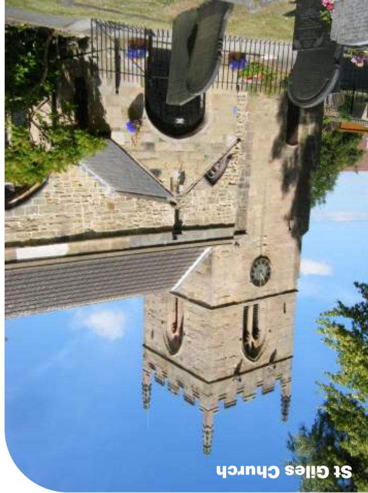
St Giles Church

Designed and produced by Derbyshire County Council, County Hall, Matlock, Derbyshire, DE4 3AG