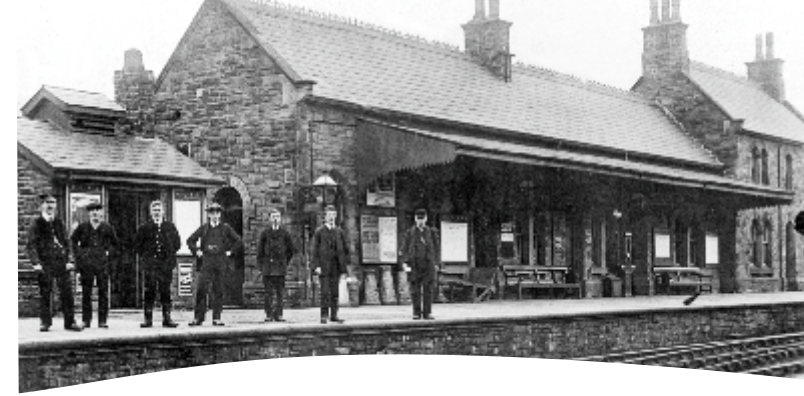
Pictured left to right: Kinder and Hayfield Station in the early 1900s.

Hayfield and the Sett Valley have been a focal point for accessing the Peak District hills for centuries, from the packhorses and railways of the past to today's visitors, walkers, climbers, riders and mountain bikers. Nestling in an area of rugged hills and steep-sided valleys, it is within easy reach of the great conurbations of the North. In the last century, thousands would come by rail, along what is now the Sett Valley Trail, to walk the hills and breathe the air. The valley played a key part in the movement to gain the right of access to Britain's mountains and moorlands, when the 1932 Mass Trespass of Kinder Scout set off from Hayfield to go up the hill.