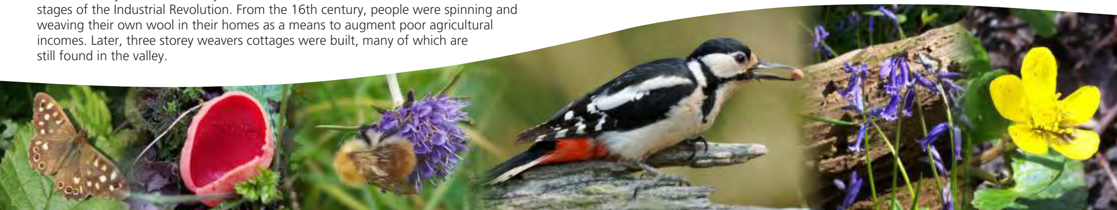
Pictured from left to right: Speckled Wood Butterfly, Scarlet Elf Cup, Common Carder Bee on Devil's Bit Scabious, Great Spotted Woodpecker, Bluebells and Marsh Marigold.

What is most striking is how the valley has recovered (with a little help from its friends) to be the glorious area of Peak District countryside it is today.