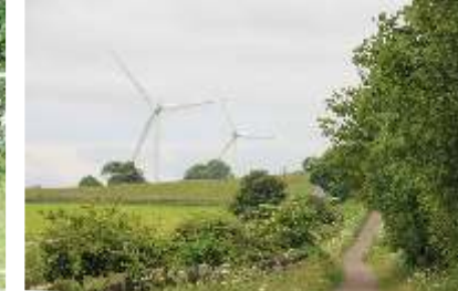
From left: Remains of the Hopton Wood boiler, Hopton Tunnel on the High Peak Trail, wind turbines from Hopton Bottom.

4 Keep the stone wall to your left, and walk up the field, watching out for capped mine shafts. At the head of the field, bear left while still keeping the wall close to you. You will soon have your first view of Carsington Water down below on your right. Still keep the wall to your left, walk along the top of the pasture. You will walk past a rock outcrop known as the King's Chair, and soon reach the woodland at the far end.