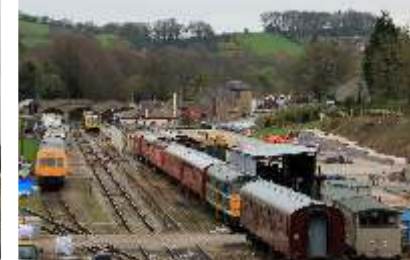
From left: view from Black Rocks across Cromford, Middle Peak Quarry, Ecclesbourne Valley Railway at Wirksworth

At the top of the steps, take the path that follows the fence line leading off to the right. The path heads upwards, eventually leading to the trig point at the summit of Barrel Edge.