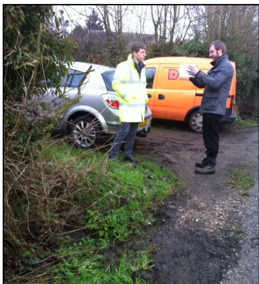
A site visit in Derbyshire

The FRM team undertakes a review of existing data before establishing whether a site visit is appropriate. Consequently, telephone discussions may take place before a commitment to a site visit is made. If the enquiry is regarded as requiring a site visit, this will be done by means of prioritisation and clustering and consequently, it may be some time before a site visit can be arranged in your area depending on the likely risk, current service demands and resources at the time.