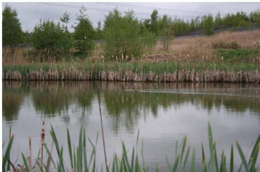
New pond at Netherthorpe.

Note: The terms Primary, Secondary or Localised feature used above are synonymous with 'Primary Habitat' etc. used in the Landscape Character of Derbyshire (2003) see www.derbyshire.gov.uk/landscape . These describe how noticeable and distinctive each habitat is within the landscape itself. Only Primary Features are shown in the detailed map of each Action Area in the Maps section.