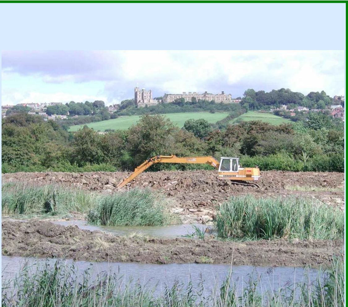
Wetland habitat creation at Carr Vale.

Prepared by the Lowland Derbyshire Biodiversity Partnership