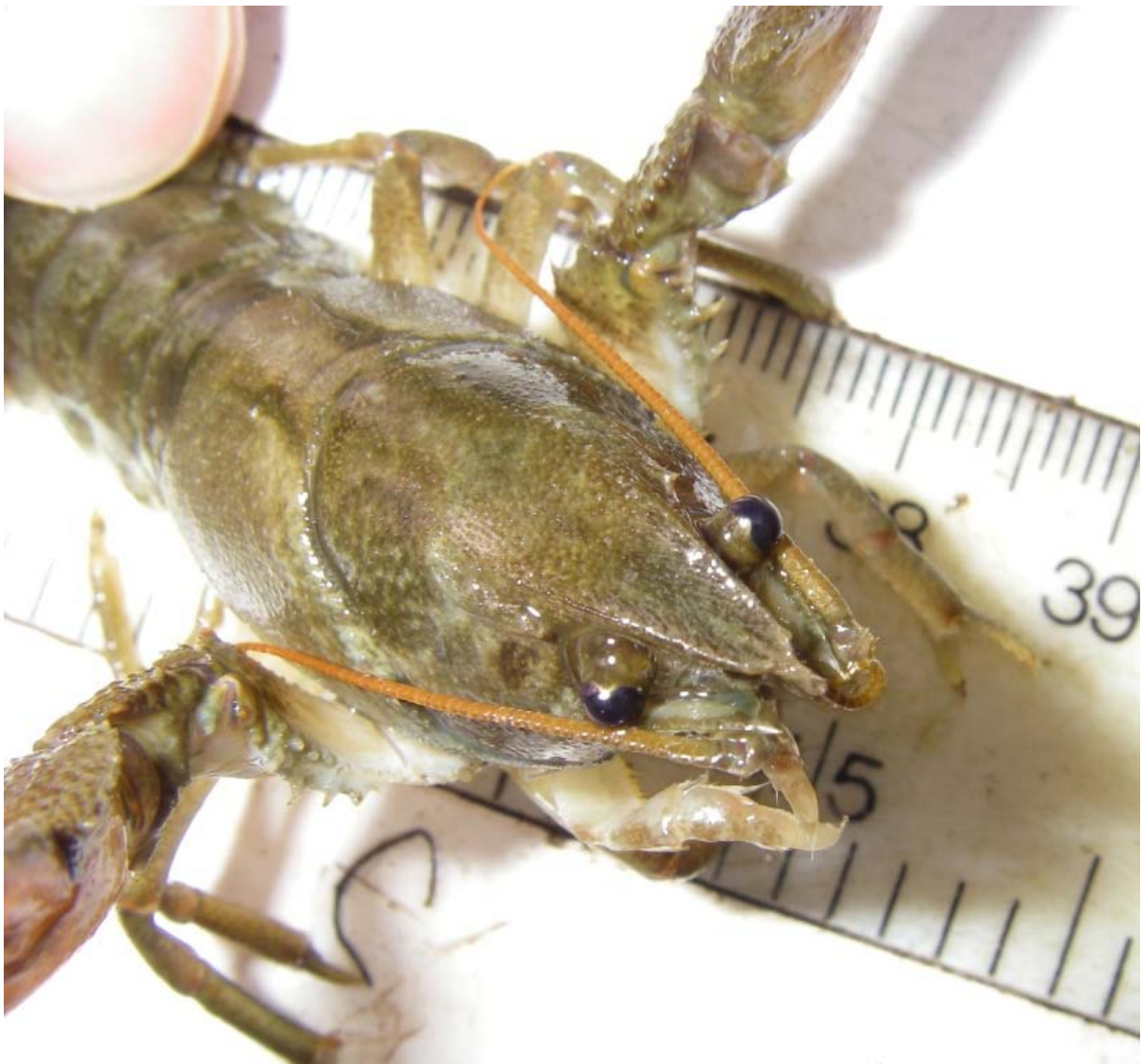
White-clawed crayfish.

White-clawed crayfish have been recorded in three grid squares (3 x 1 km 2 ) since 2000. Until recently white-clawed crayfish have been recorded on the Hipper, the River Whitting and the lower part of the Barlow Brook. However, recent survey work has only confirmed their presence on the upper part of the Barlow Brook, just upstream of the section within this area. An ark site was set up at Holmebrook Country Park in 2008 and another healthy population exists on an isolated lake in Wingerworth. Target: Increase range by two 1 km 2 by pursuing opportunities for ark site creation.