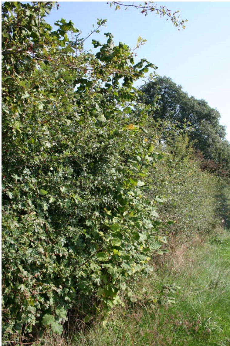
Hedgerow.

@ Green roofs Although not a UK Priority Habitat, the installation of green roofs on new developments and also on some existing urban structures can make a considerable contribution to biodiversity in towns and cities. For this reason they have been included in targets within the Rother and Doe Lea Valley area.