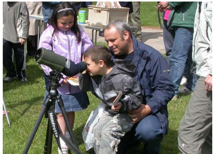
Introducing people to Peregrine Falcons at Derby Cathedral.

7. Manage sites, within partners' ownership, for the achievement of the LBAP targets.