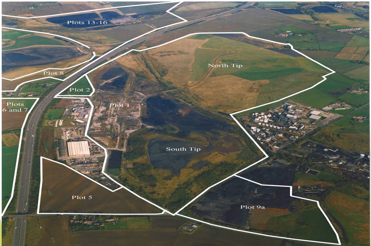
Figure 1.3b: Aerial photograph of Markam Colliery and Development plots