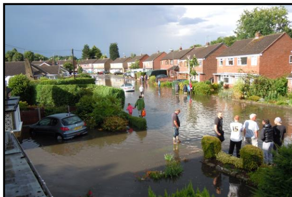
Surface water flooding in Derbyshire

Surface water flooding, often referred to as pluvial flooding, occurs when rainwater or other precipitation does not drain to the subsoil/watercourse but lies on or flows over the ground surface instead. Surface water flooding is often associated with all other sources of flooding and is often related to runoff over steep sided land.