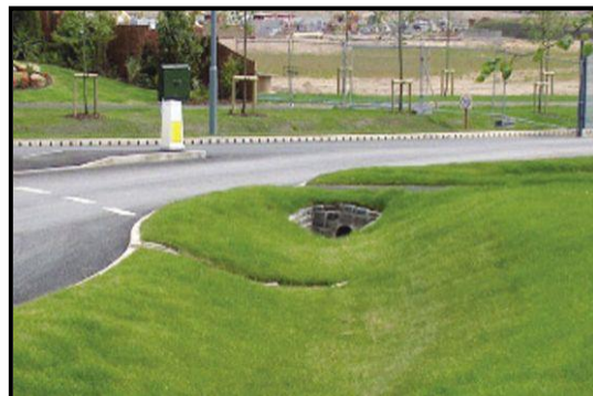
Example SuDS: A roadside swale

Traditionally surface water has been managed by using underground piped systems to transfer water to local watercourses or local sewerage works as swiftly as possible. Sustainable Drainage Systems or SuDS provide a slower more sustainable approach and can provide a multitude of benefits for managing surface water including helping to reduce flood risk.