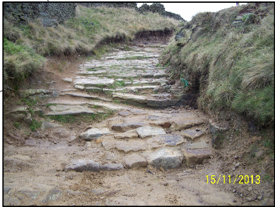
EXAMPLE OF STONE PITCHING TAKEN FROM WORKS ON ROYCH CLOUGH MAX UPSTAND 100mm