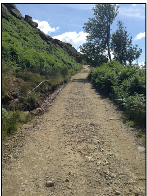
EXAMPLE OF PROPOSED SURFACING, TAKEN FROM A RESURFACED TRAIL AT LONG CAUSEWAY UTILISING GRANULAR (GRITSTONE) TYPE 1 SUB BASE SURFACING