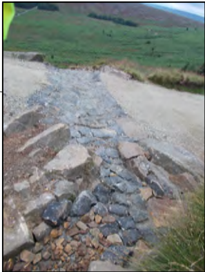
EXAMPLE OF TRANSVERSE STONE PITCHED DRAINAGE CHANNEL TAKEN FROM WORKS ON LONG CAUSEWAY

THE EXISTING TRAIL SHALL BE RESURFACED USING A COMBINATION OF GRANULAR (GRITSTONE) TYPE 1 SUB BASE AND WHERE THE NATURAL STONE BED ROCK OUTCROPS, NATURAL STONE PITCHING. THE NATURAL STONE BED ROCK TO BE RETAINED WHERE POSSIBLE. TRANSVERSE STONE PITCHED DRAINAGE CHANNELS TO BE INSTALLED TO CONVEY SURFACE WATER INTO PROPOSED DITCH