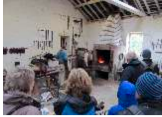
High Peak Junction interior