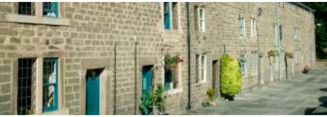
North Street, Cromford