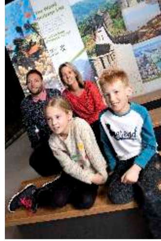
In Cromford's Gateway