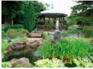
Belper River Gardens