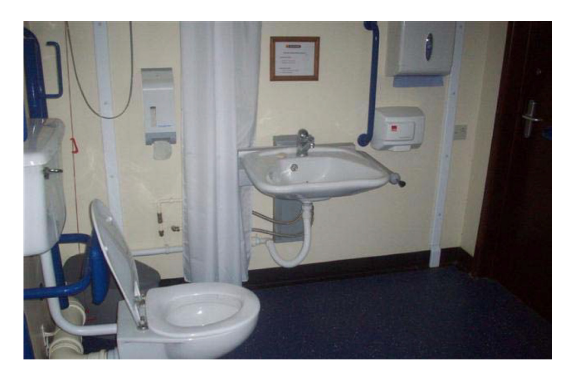
Height adjustable wash hand basin