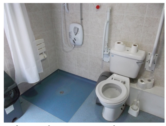
Level access shower