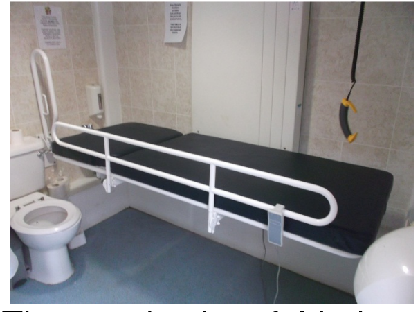
The couch when folded out