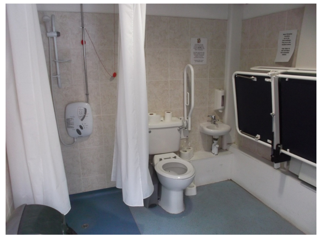
Access to the toilet with the couch folded away