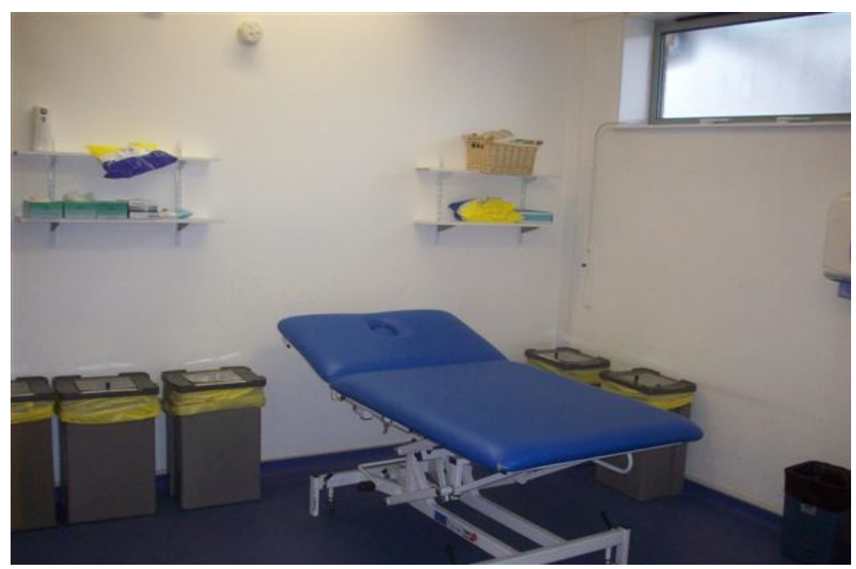
Room 2 layout