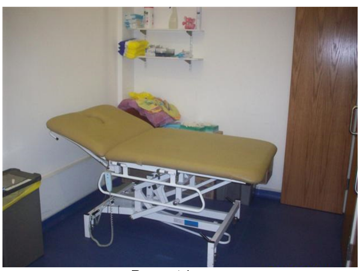
Room 1 lay out