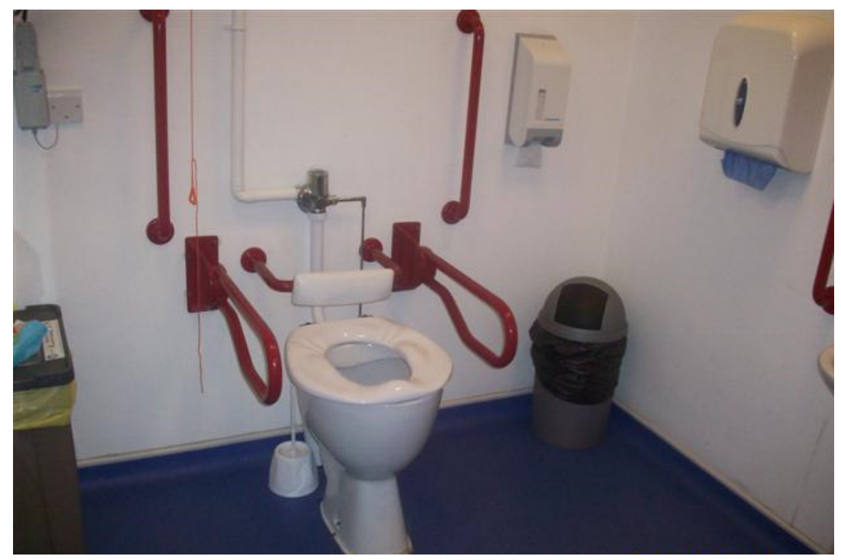
Separate accessible toilet