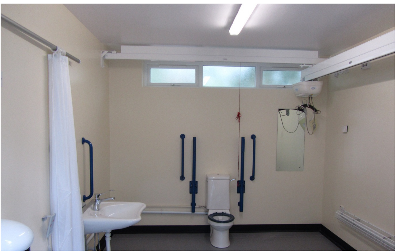
Inside the Changing Places