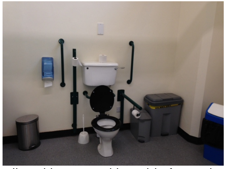
The toilet with space either side for assistance