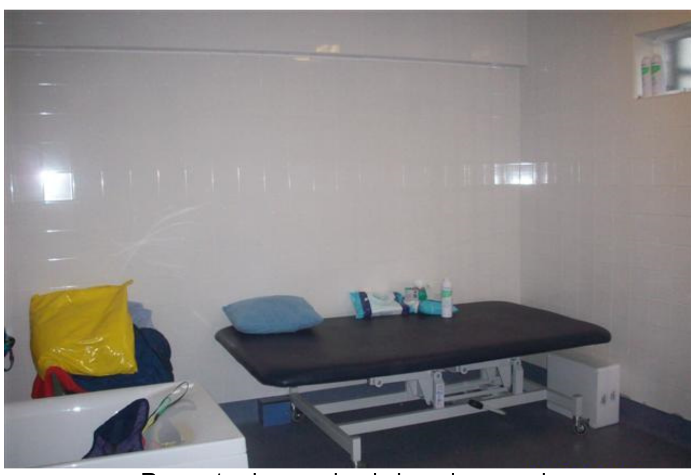
Room 1 – larger sized changing couch