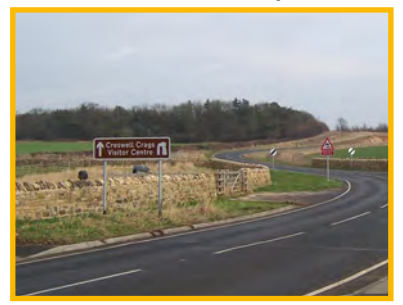
Locally distinctive dry stone walls