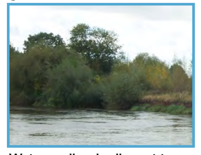
Wet woodland adjacent to lakes