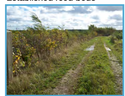
New hedgerows adjacent to green lane