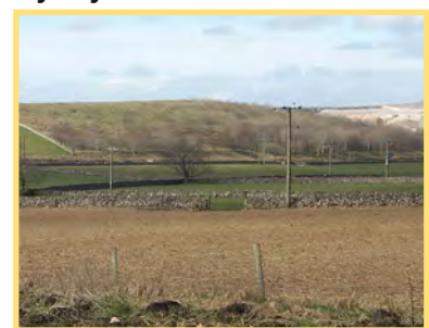
Small plantation woodland