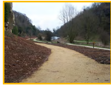
Reinstated scree slopes