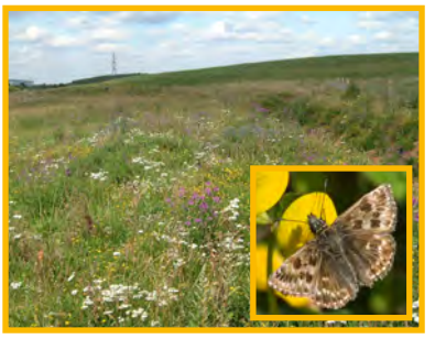
Creation of calcareous grassland for Dingy Skipper butterfly