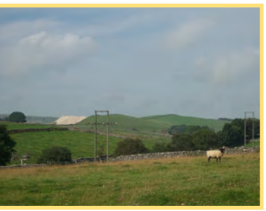
Gently rolling landform