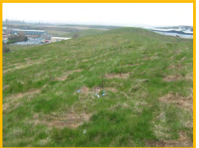
Gently rolling landform