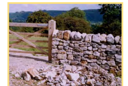
Dry stone wall repairs