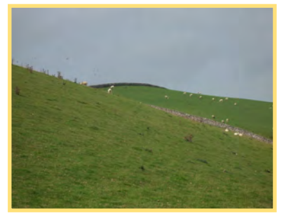
Tip managed by sheep grazing