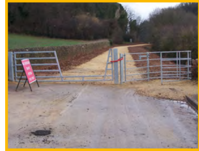
Crushed magnesian limestone surfacing and simplified access arrangement