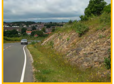
Retention of exposed geology adjacent to new road with species rich grass verge