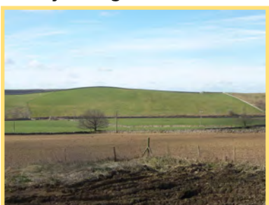
Pastoral land-use enclosed by dry stone walls