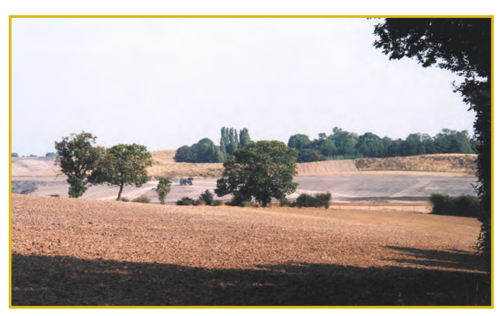
Open cast coal mining