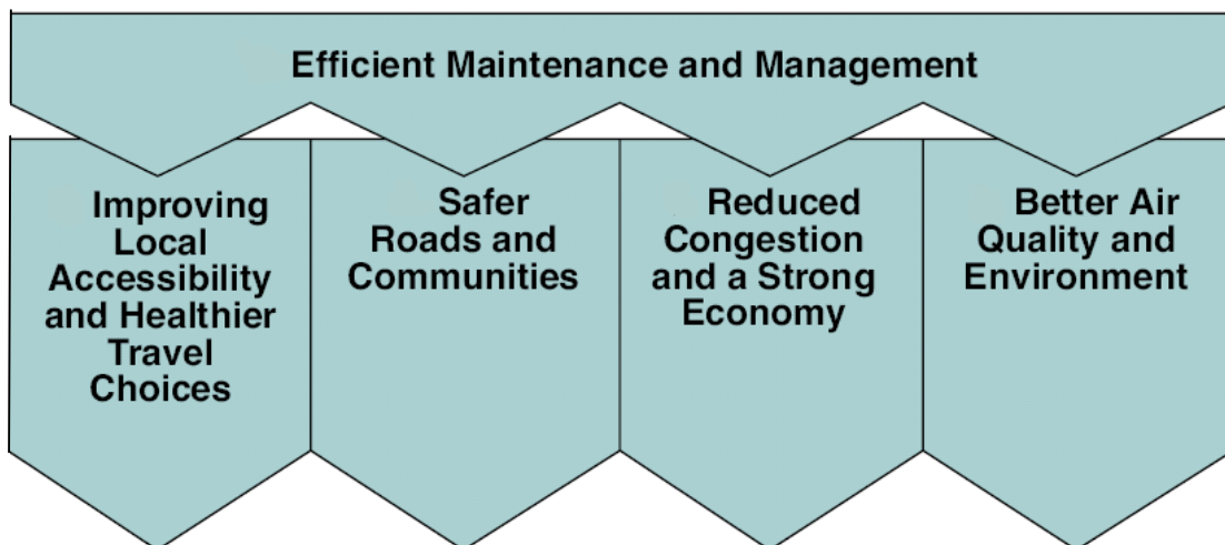
Figure A3: The Five Priorities in the Derbyshire Local Transport Plan (LTP2)

The Derbyshire LTP has five Transport priorities, as is shown in Figure A3, below.