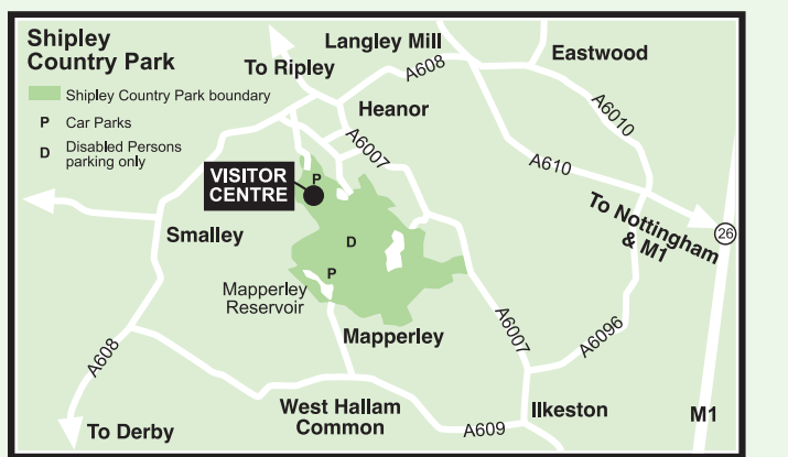
The main entrance to the country park is well signposted from Derby Road (A608) and from the motorway, M1 Junction 26.