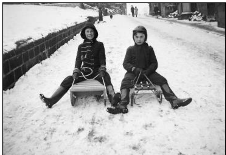
DCHQ006226 - Sledging at Hall Bank, Buxton, 1940s