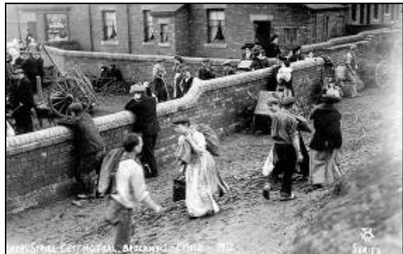
DCCC001328: Getting coal in Brockwell, Chesterfield during the Miners Strike in 1912

Read more about ‘Picture the Past’ and see a selection of their festive images on pages 4 and 5.