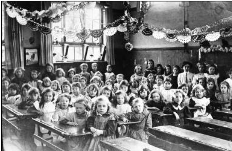
DCBR000159 - Model Village School Class, Shirebrook, Christmas 1917

'Picture the Past' have a truly diverse set of photographs in their collections and this small selection below shows just a few of their photographs based around the theme of Winter. Some of them certainly put last year's cold spell into perspective!