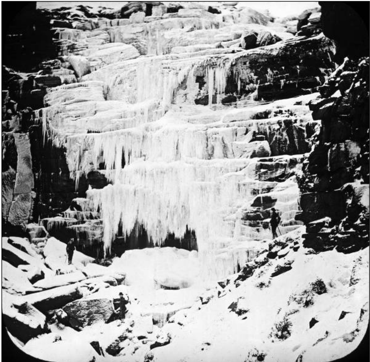
DCBM200278 - A frozen Kinder Downfall, 1930's - Can you spot the three men?