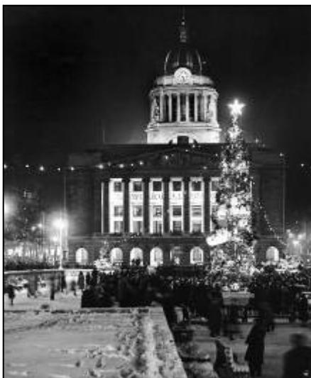
NTGM010077 - Old Market Square, Nottingham, c1950s