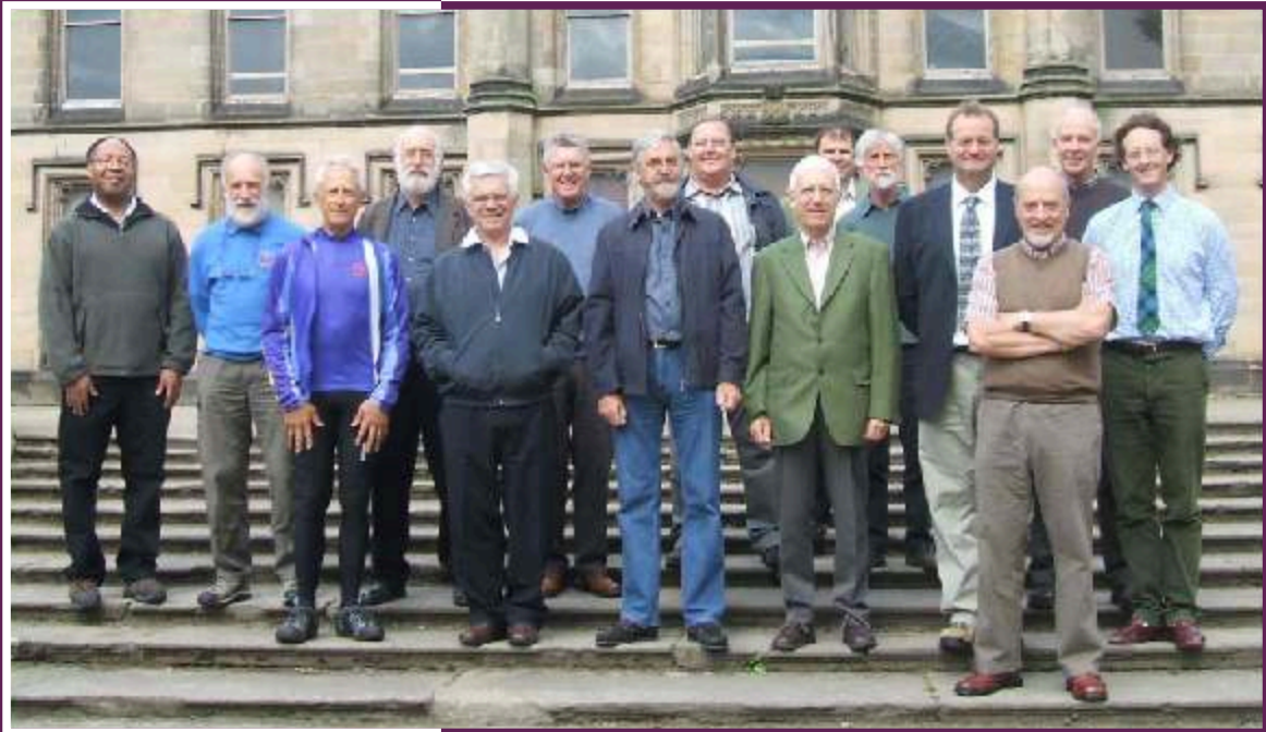
Forum Members at the June meeting held at Elvaston Castle

Dedicated to the promotion and improvement of public access and rights of way