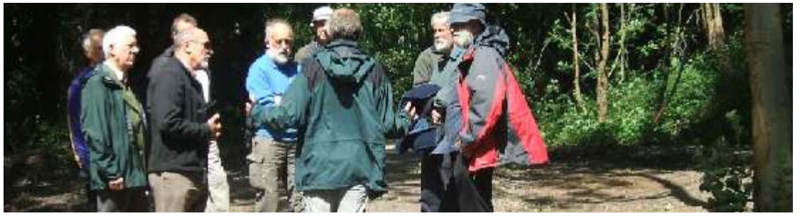
Members attending a site visit on the Great Northern Greenway with a local ecologist