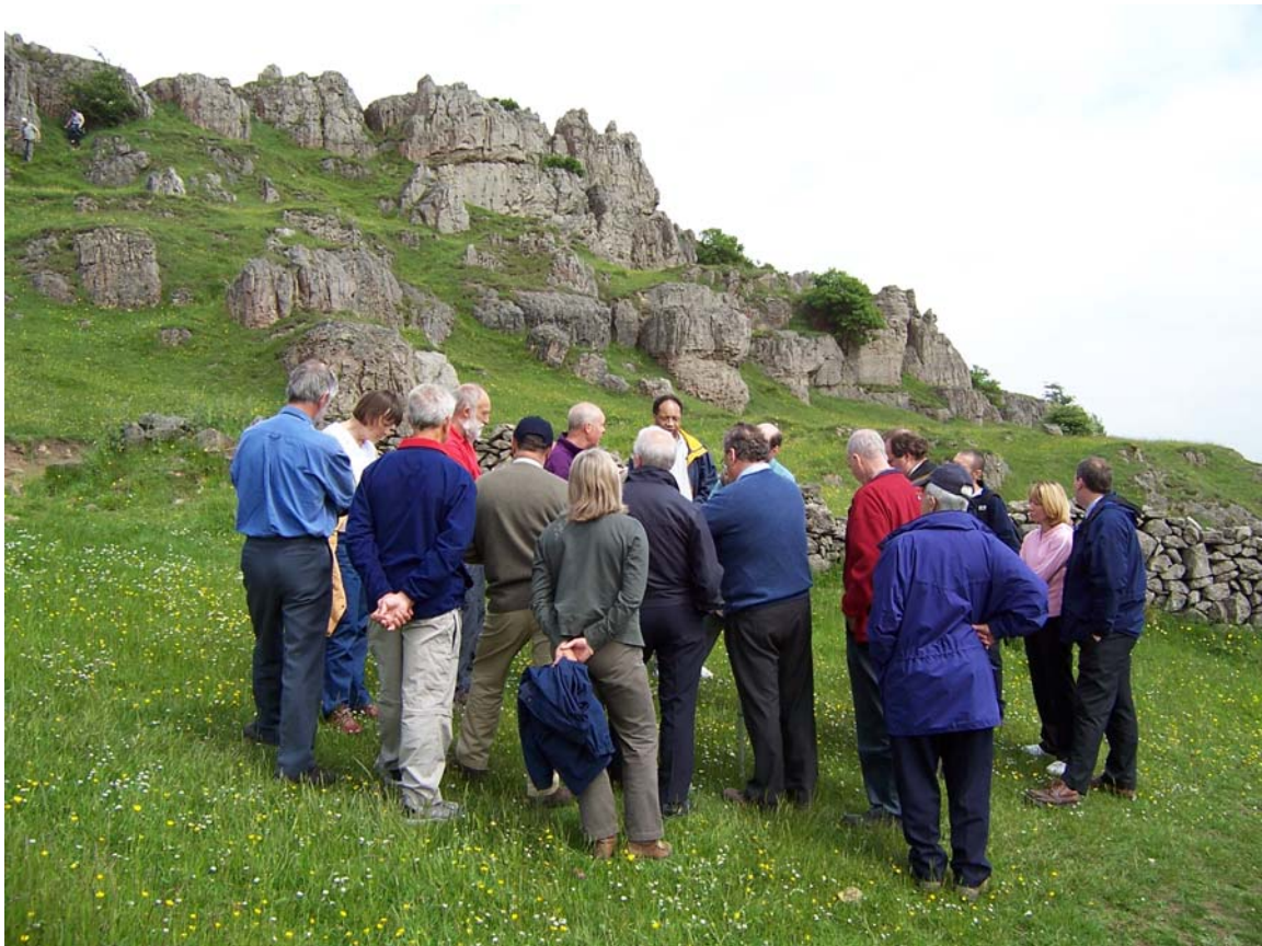
LAF members inspect newly designated access land at Harboro Rocks