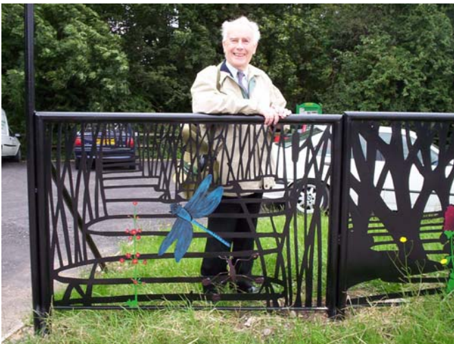
Interpretation at Forbes Hole LNR.

Action by: BTCV, Derbyshire Wildlife Trust, Forestry Commission, FWAG, Groundwork Derby & Derbyshire, LBAP Partnership, National Forest Company, Natural England, RSPB, WildDerby, landscape projects, community groups and county specialists as appropriate.