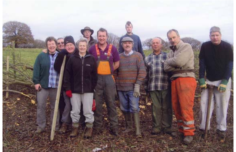
Left: Pond restoration. Credit: Bolsover Woodland Enterprise Right: The Moss Valley Wildlife Group hedgelaying on their Silver Jubilee. Credit: Moss Valley Wildlife Group