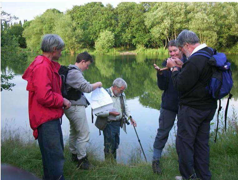
Plant recording for the Flora of Derbyshire project.

Action by: Natural England and Derbyshire Constabulary, aided by local species experts and Derbyshire Wildlife Trust