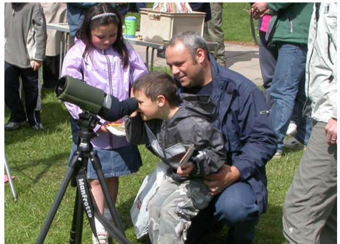
Introducing people to Peregrine Falcons at Derby Cathedral.

7. Manage sites, within partners' ownership, for the achievement of the LBAP targets.