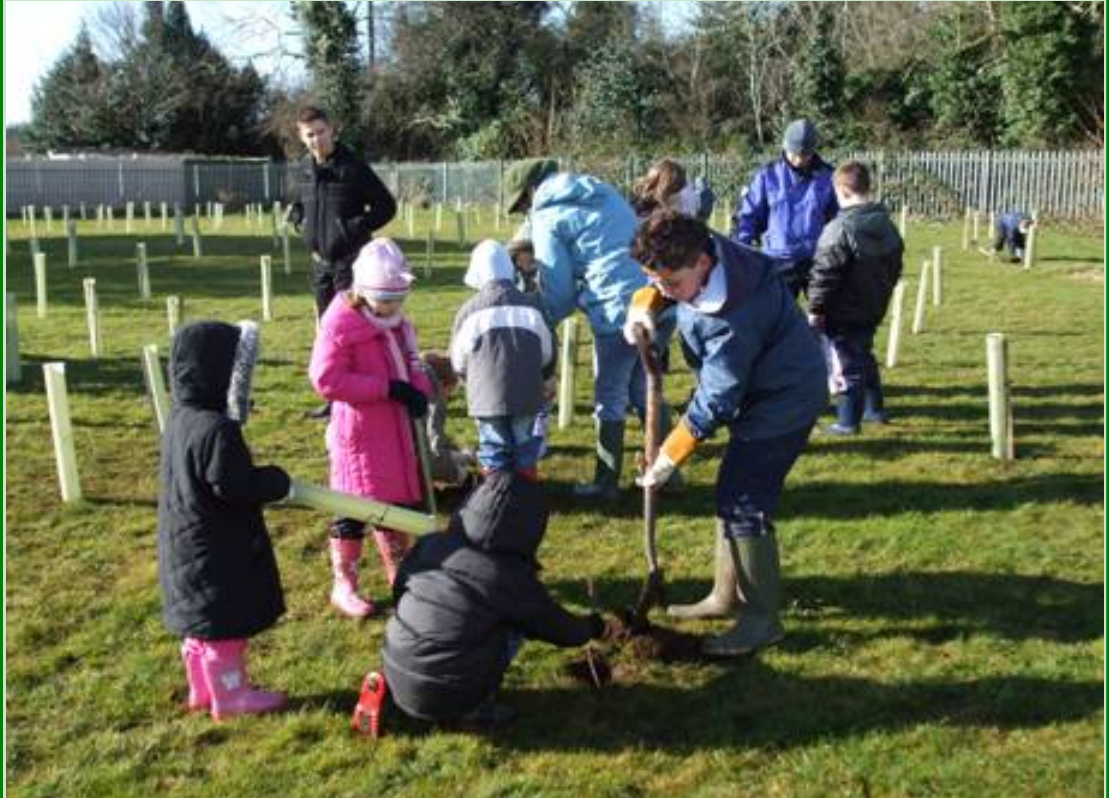
Tree planting at Langwith Junction

Prepared by the Lowland Derbyshire Biodiversity Partnership