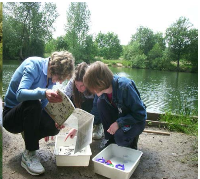
Surveying aquatic life in ponds.