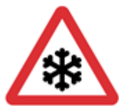
Ice Warning Sign – Diagram 554.2

Objective: To be used when a route is unusually dangerous as a result of extensive icing or heavy snowfalls.