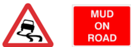
Slippery Road Warning Sign – Diagram 557 or Mud on Road sign

When to remove: The signs should be removed when the hazard no longer exists. Ice signs should only remain permanently following consultation with the Traffic and Safety section.