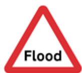
Flood Warning Sign – Diagram 554A

When to remove: When the defect has been remedied.