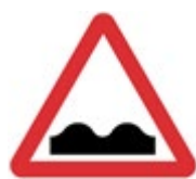
Uneven Road Sign – Diagram 556

Permitted signs for use on Reactive Maintenance operations in conjunction with the Highways Infrastructure Asset Safety Inspection Manual (HIASIM), and the Reactive Maintenance Teams Operational Manual (RMTOM)